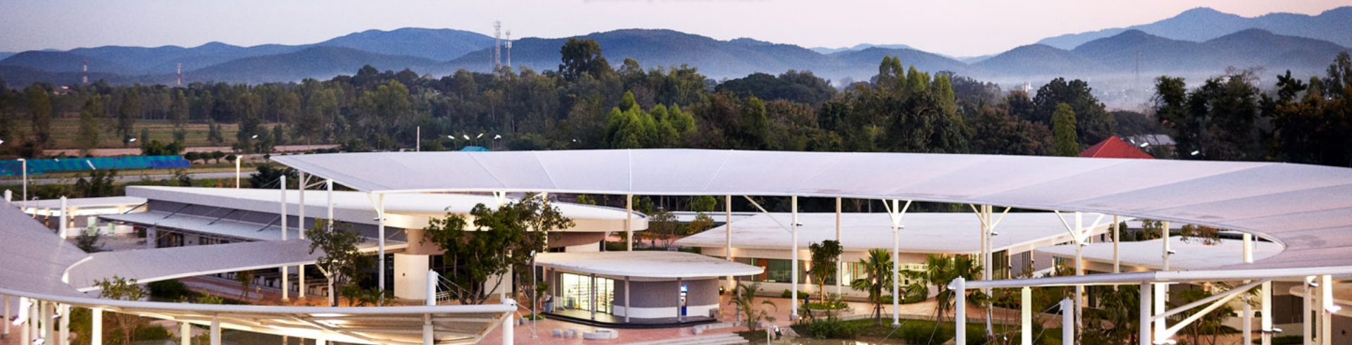
Photo: In 2017 we opened our LEED Gold certified crafting facility in Lamphun, near Chiang Mai, in Northern Thailand

Million pieces of jewellery crafted in 2017